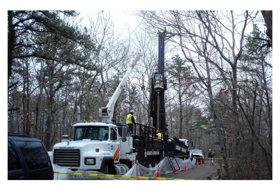
Photograph of drill rig and equipment